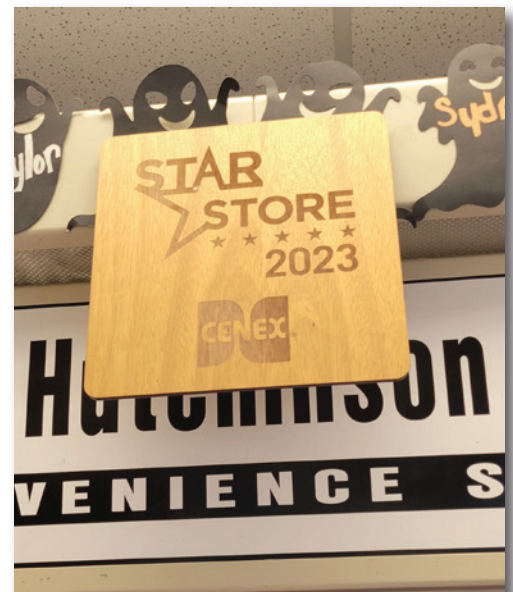
Adam's Street C-Store earned the award, Star Store for their Red Inspection.