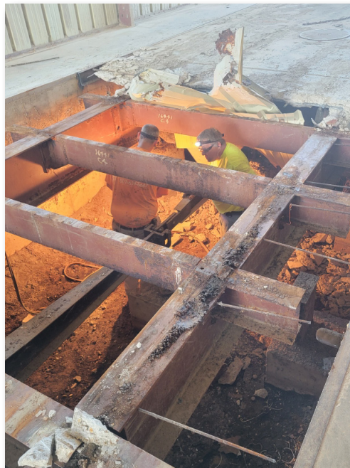
Old scale out