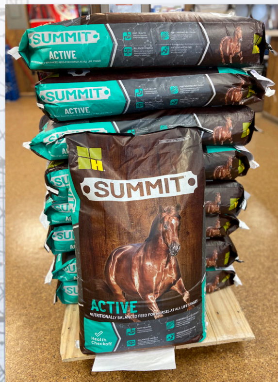
Summit Horse Feed

Lastly, I would like to direct my final thoughts to our members in the Arlington area. Several years back we would transfer some of our bagged products to the facility in Arlington. Due to warehouse changes we discontinued that. I would like to find a way to take care of your needs out of our facility here. If you are interested in bulk feed, we can set up a time to meet with our Hubbard reps and get a ration set up. If you are interested in our bagged feed, I am considering different ideas to bring the feed that way every couple of weeks. Simply put in an order and I will figure out the best way to get it to you. If you are in town stop in and see what we have to offer! We carry a variety of different products ranging from bunnies, beef, dairy, and everything in between.