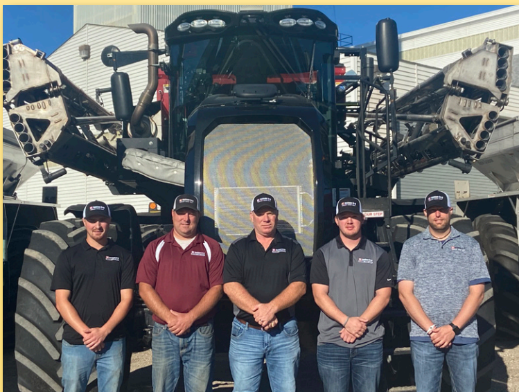
Agronomy Sales Team