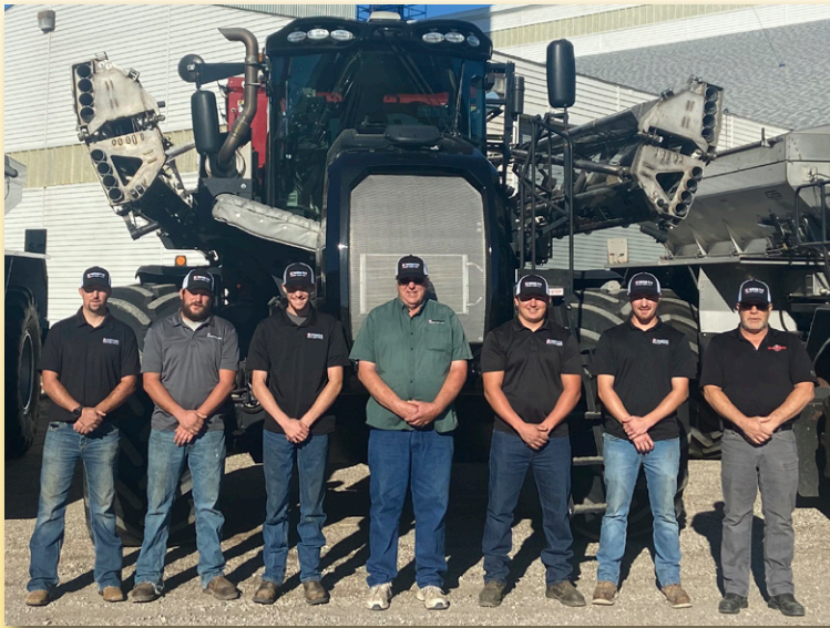
Agronomy Applicators Team