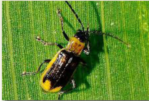
Corn Root Worm Beetle

First reason is that delayed emergence of weeds will occur which can directly influence herbicide timing concerns. Second reason that dry conditions will "harden" the weed and make the herbicide less effective. As a consequence, additional herbicide applications will need to be made to obtain adequate weed control.