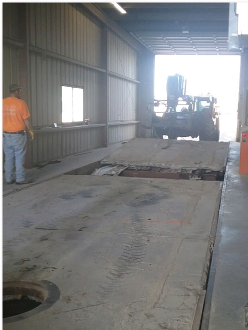
Taking out the old scale