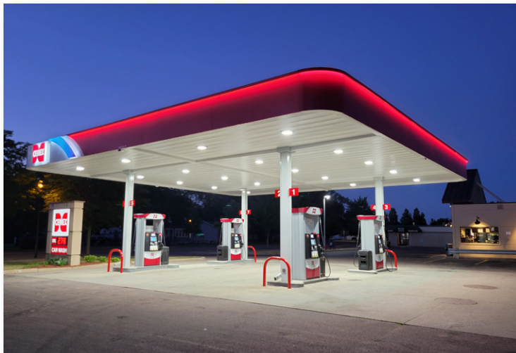
New canopy lighting